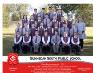
Class Photo 8"x10"