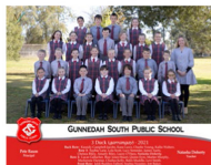
Class Photo 8"x10"