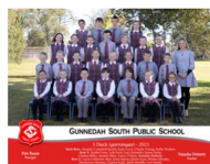
Class Photo 8"x10"