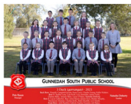
Class Photo 8"x10"