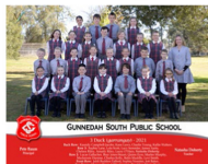
Class Photo 8"x10"