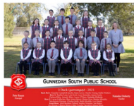
Class Photo 8"x10"