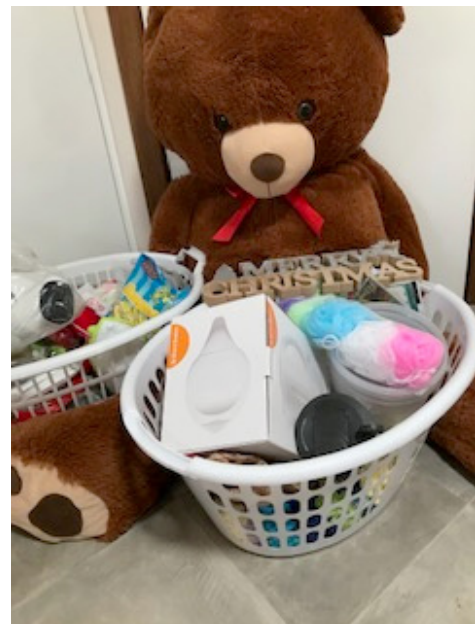
Generously donated by our P&C