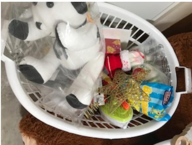
Generously donated by our P&C

GIFT VOUCHER Kindly donated by Railway Hotel Gunnedah