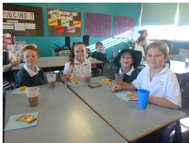
Yummy warm milo and toast last Wednesday

The 3/4H CAFÉ will be open for business again this Wednesday.