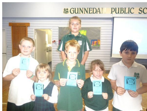
Ebony presenting the Sports awards