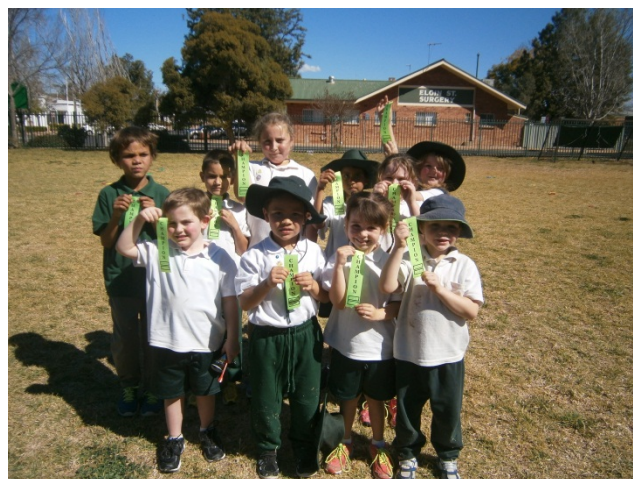
Age races winners

All the students were well behaved and had a fun day in the beautiful sunny weather. After the carnival the entire school was able to take advantage of the delicious treats at the canteen, kindly supplied by the P&C.