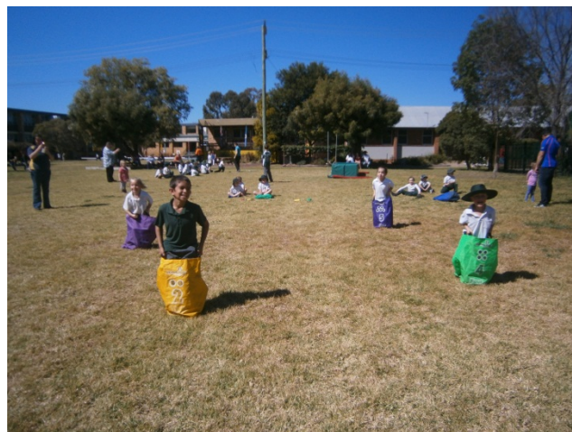
Sack races were lots of fun!