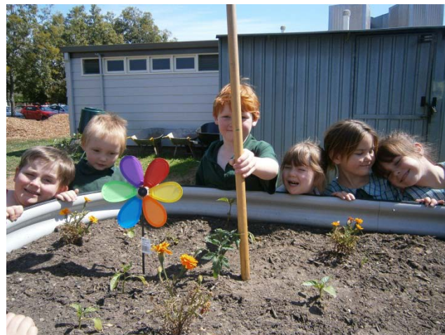
How much will they grow?