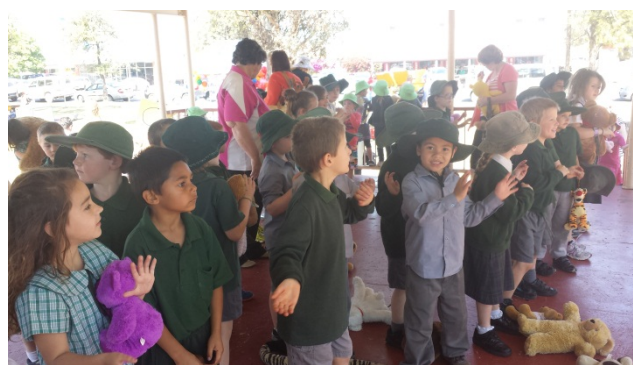
KS students at the picnic