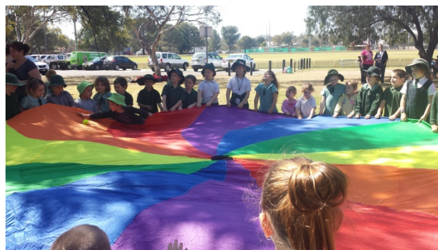
Parachute fun with the Teddies.