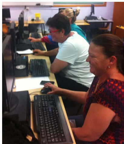
Keen participants at the computers making photo books

A photo book workshop was offered to parents/carers as an Indigenous Literacy Day activity last week. Ms Horvat worked with a group of interested people to show the process of making a photo book for their child. Each participant was successful in creating their own book to be published and it is hoped that this is just the start of many books to come for those families. A second photo book workshop will be held in Term 4 for those who are interested.