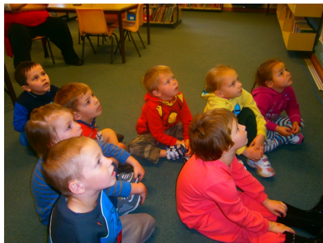
Early Birds enjoying the library