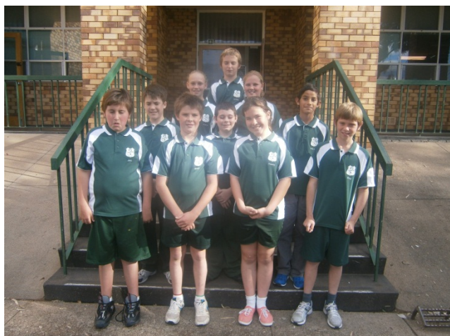
Year 6 modelling their new shirts.