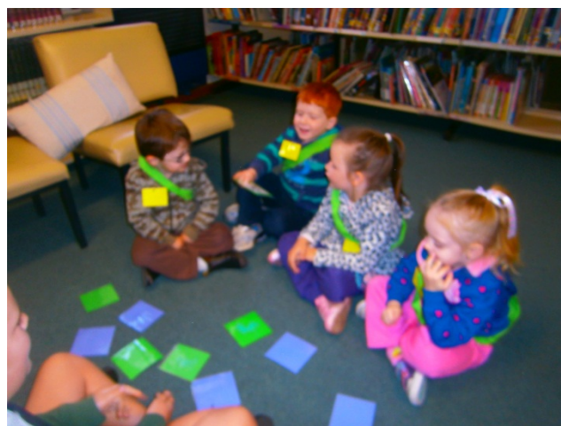
Some of the pre-schoolers who recently visited our school.

Early Birds, our transition to school program, will begin in Term 3. This year Early Birds will be held every Thursday. Please come along to an information morning tea on Wednesday 12 June at 10:30am if you have a child starting school in 2014.