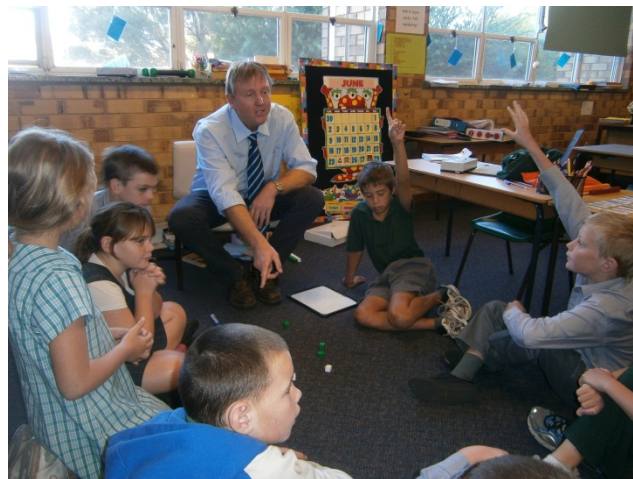
3-6F engaging with Maths