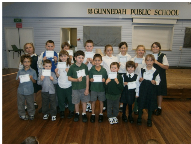
The assembly award recipients.