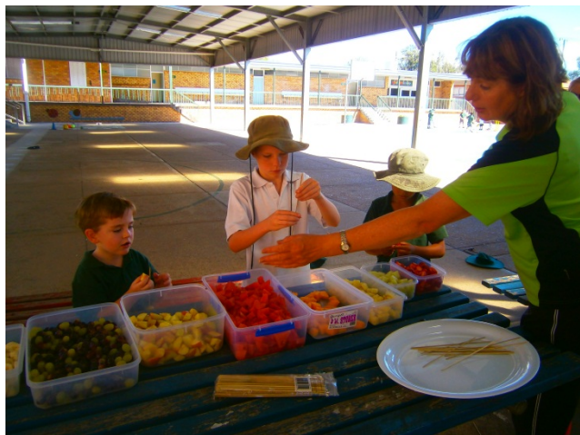
A delicious fruit break to end term one.