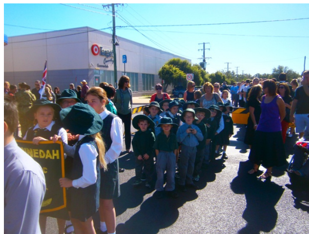
Lining ready to march on ANZAC Day.