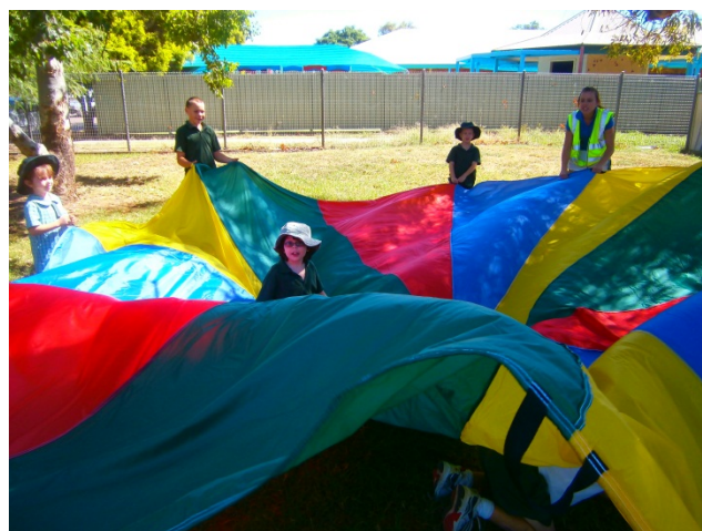
Parachute fun to end term one.