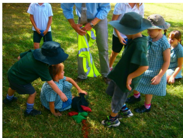
Everyone enjoyed participating in the activities.

Every week the kids here at Gunnedah Public continue to show everyone that they are confident, organised, persistent, resilient and that they get along with everyone. We look forward to a productive, happy and successful term 2.