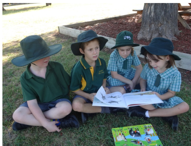
This year's kinder students have made wonderful progress.