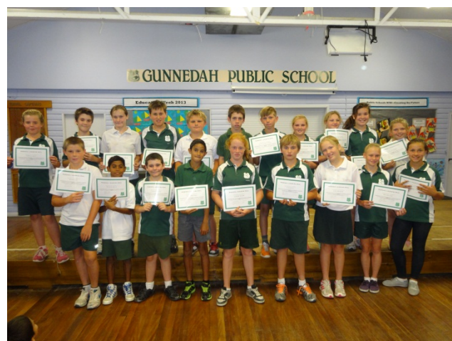
Year 5&6 leaders were presented with a certificate at last Friday's assembly.